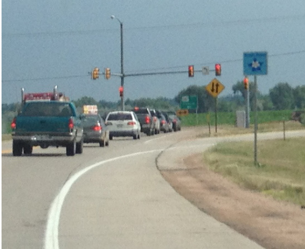
4 th Byway sign west of County Rd 54G