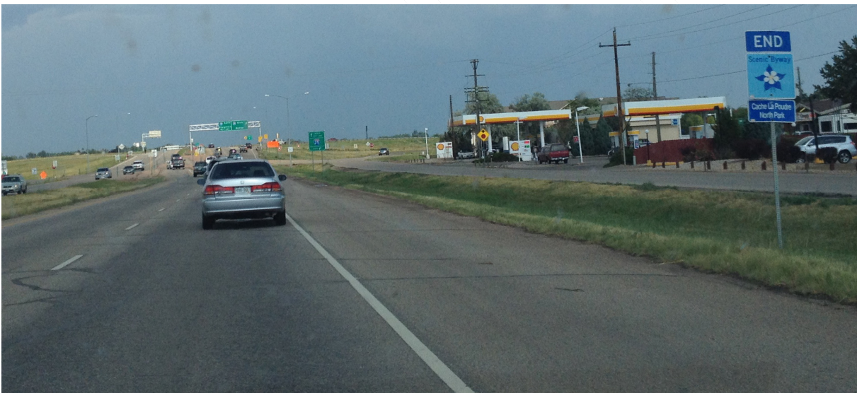
6 th and final Byway sign near I-25 in Fort Collins