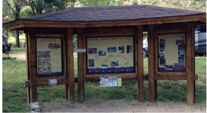
Arrowhead Lodge Kiosk