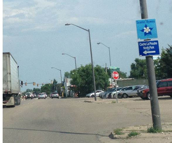
5 th sign on Riverside Ave west of Mulberry St