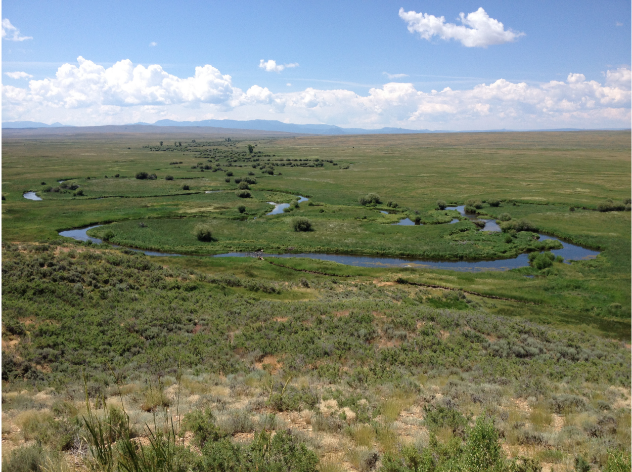
Arapaho National Wildlife Refuge in North Park

Enhancing the existing wayshowing system can help to guide visitors along the Byway in a meaningful and memorable way. A strong wayshowing system can result in greater safety and a deeper understanding of the historic and recreational assets that make the Cache la Poudre-North Park Scenic Byway special.