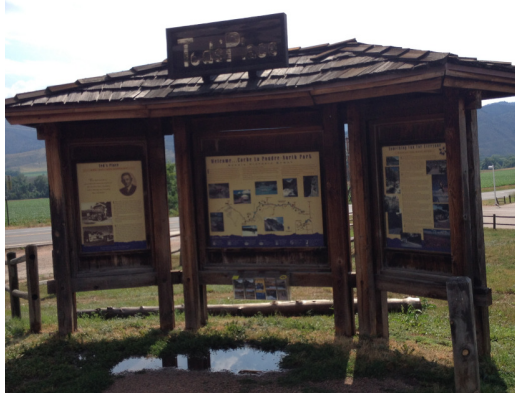
Ted's Place Kiosk