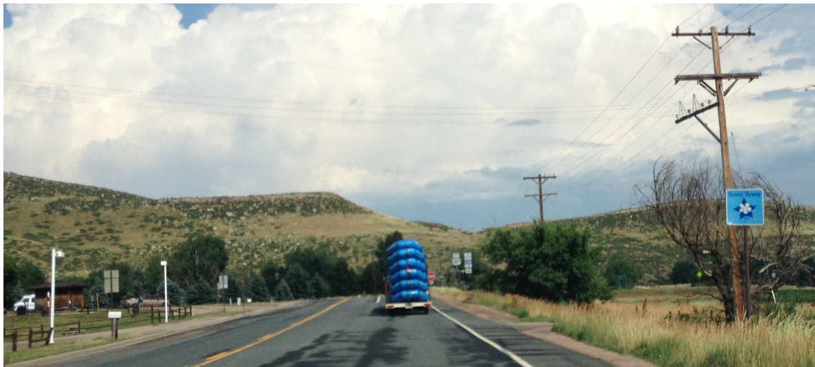
3 rd Byway sign near Ted's Place, westbound