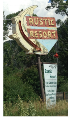
Business signage in Poudre Canyon