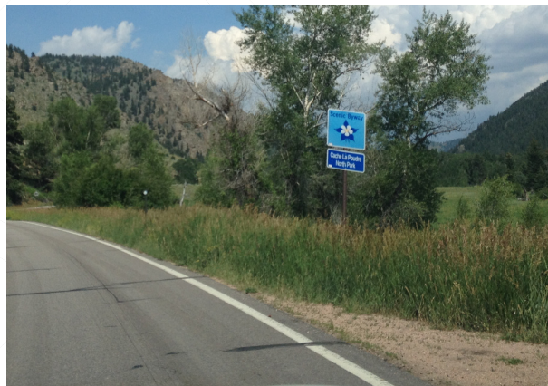
2 nd sign west of intersection with County Rd. 69