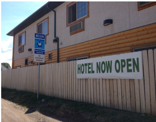
1 st Byway sign in Walden, westbound