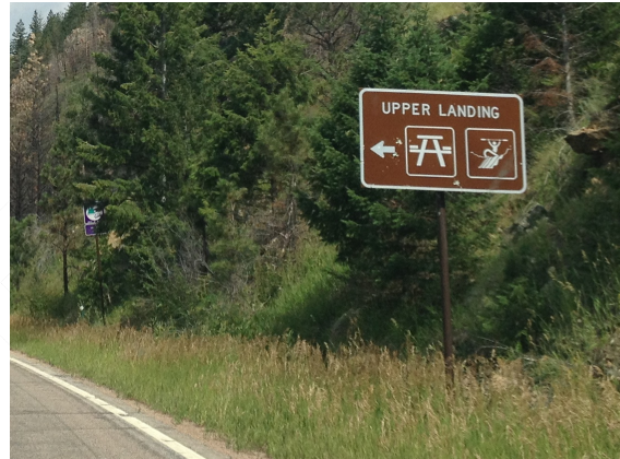
Recreation icon signage in Poudre Canyon